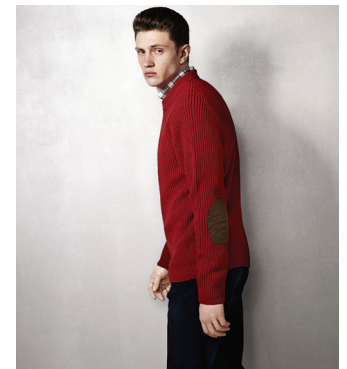
Heading into stores: Fred Perry

How did trading for the final Christmas week compare with the same week in 2010?