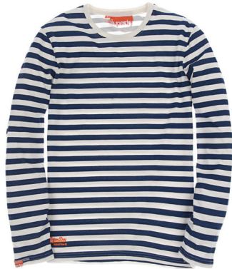
Earning its stripes: Superdry on top